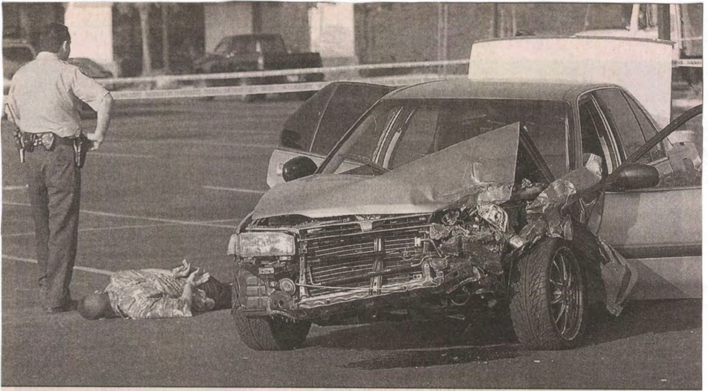
The front end of the suspects' automobile is crumpled after it rammed the undercover officers' unmarked truck.